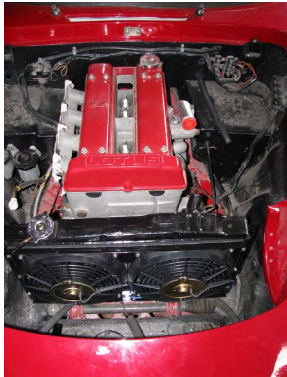
Trial fit of twin fan system

NOTE: The lower radiator closing panel is missing in this photograph. This panel usually covers the steering rack and forces all the incoming air through the radiator instead of escaping underneath.