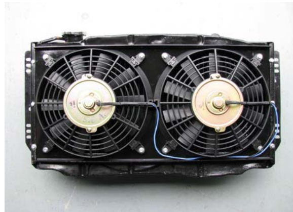
Front view of awesome Elan radiator twin fan assembly NOTE: No bolts go through the radiator with the Lotus Marques System

Here are a set of high quality dust caps that are manufactured in brass and chrome plated. These should not be confused with cheaper plastic offerings. The Lotus badge has a domed lens incorporated into the design. This set also includes an anti-theft screwdriver to secure the caps to the valve stem. The black velvet bag completes the gift set.