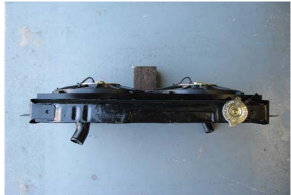
Top view of ultra low profile twin fan system