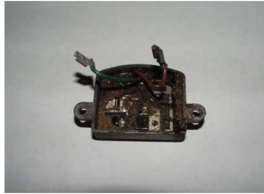
Close up of Valeo voltage regulator