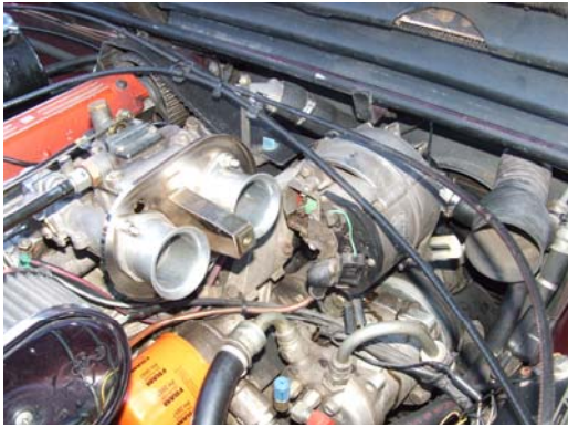
Alternator regulator melted

This vehicle is a 1989 Lotus Excel SA was originally acquired by the current owner over four years ago. During this time various tasks have been carried to improve the overall condition. This has included a new roof lining, a replacement window lift motor and gear quadrant supplied by The Elan Factory. This vehicle drives well through the Getrag automatic gearbox. It can also be driven like a manual vehicle to realize the full potential of the 180bhp twin cam engine under the bonnet. It is also an ideal form of ever day transport as it offers the comfort of four seats plus a large boot for luggage.