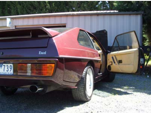
Rear driver side view