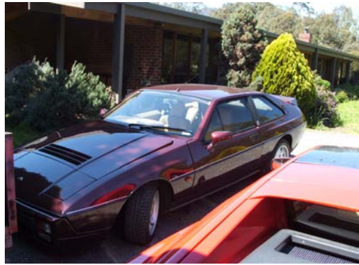
Front view of a tidy Excel