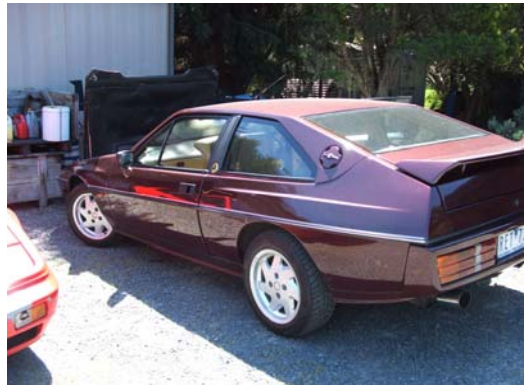
Rear passenger side view