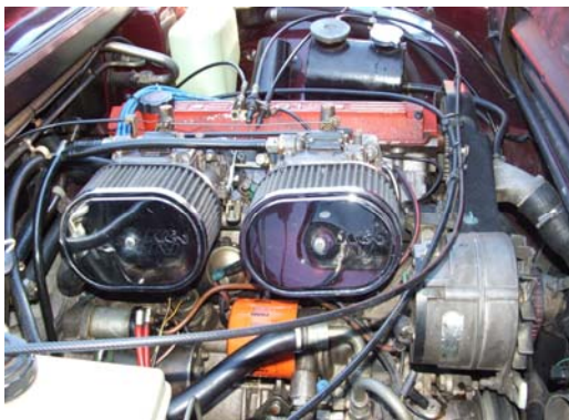
Dellorto carburetors appointed with K&N filters