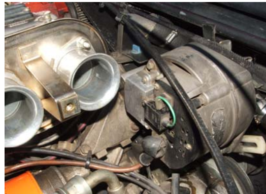
New voltage regulator installed