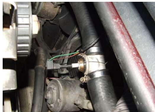
Faulty thermal fan switch replaced