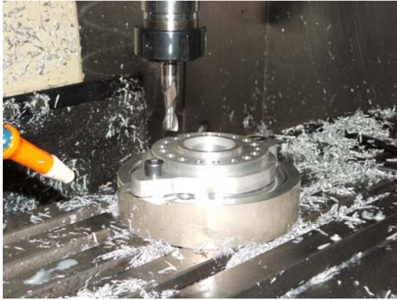
Photograph depicts adapter plate bolted to fixture prior to machining