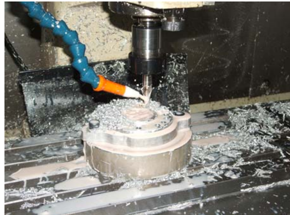
Photograph depicts the adapter plate being machined with counter bored holes